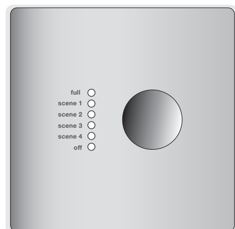
Scene select wall plate: MMES-6