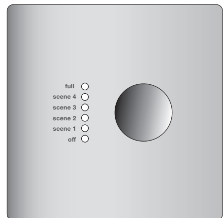
Scene Select Plate: MMES-6